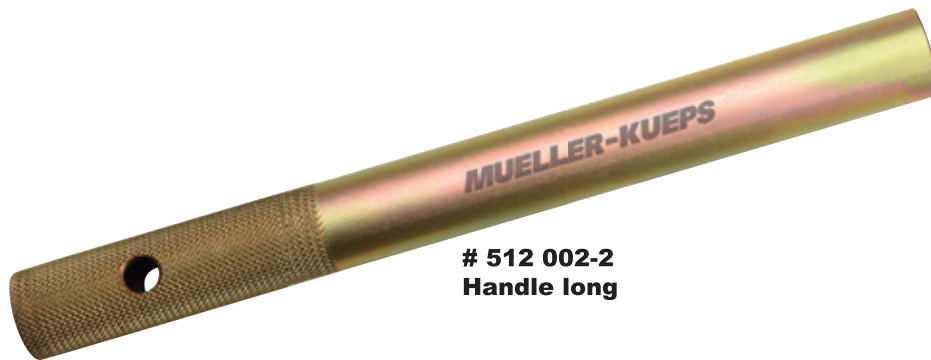
# 512 002-2 Handle long