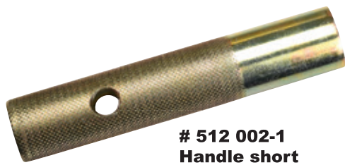
# 512 002-1 Handle short